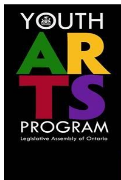
EXHIBIT YOUR ART AT THE LEGISLATIVE ASSEMBLY OF ONTARIO!

Important information for ROC King on page 3